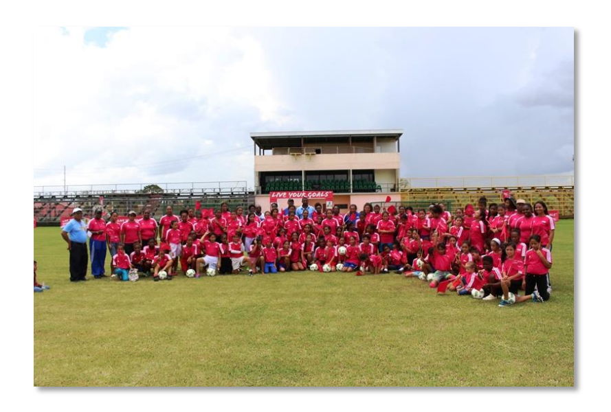
Saturday, September 24th, 2016

The Districts of Corozal and Orange Walk were the first to partake in the one of a kind event.