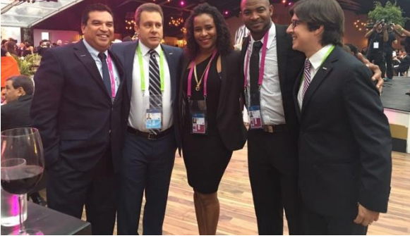
FFB's Executive Members at Mexico City for FIFA Congress 2016